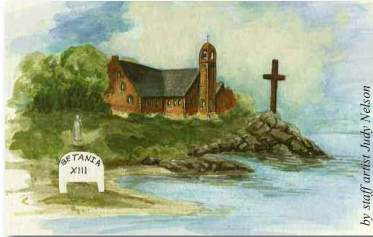
Imaginative vision of the future sacntuary of Betania XIII