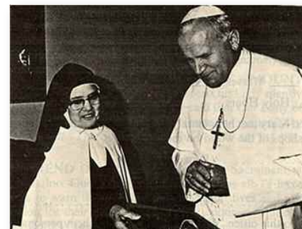
Sister Lucy & the late Pope John Paul II

Our Lady showed us a great sea of fire which seemed to be under the earth. Plunged in this fire were demons and souls in