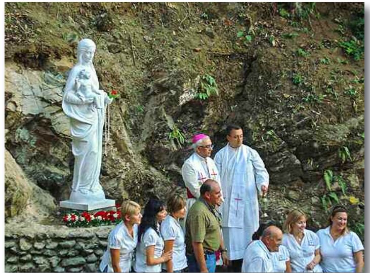
The Grotto where Our Holy Mother appeared