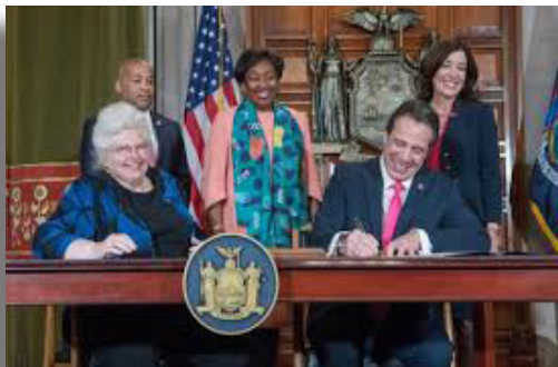
"Como Modern Day King Herod ~ Kill Children"

We practicing Christians are bound by the second commandment to love our neighbor. No exceptions! But the, "Liberal PC World", has convinced the general public we are people of Hate. Satan and his cohorts are very convincing.